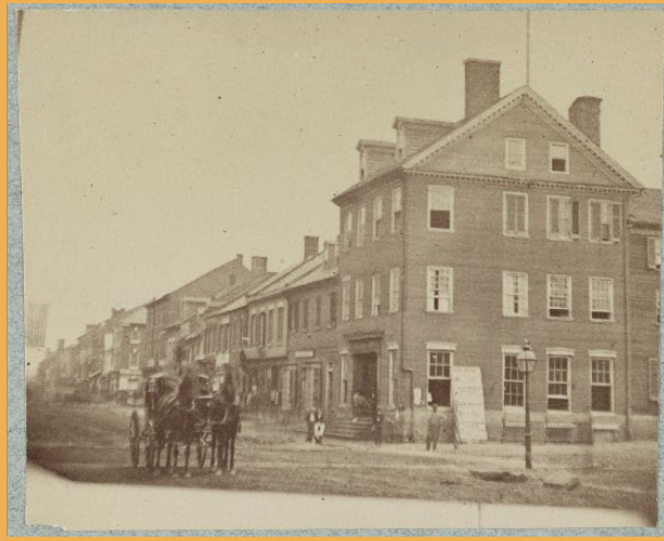
1861 Photograph of the Marshall House, Alexandria, Va.